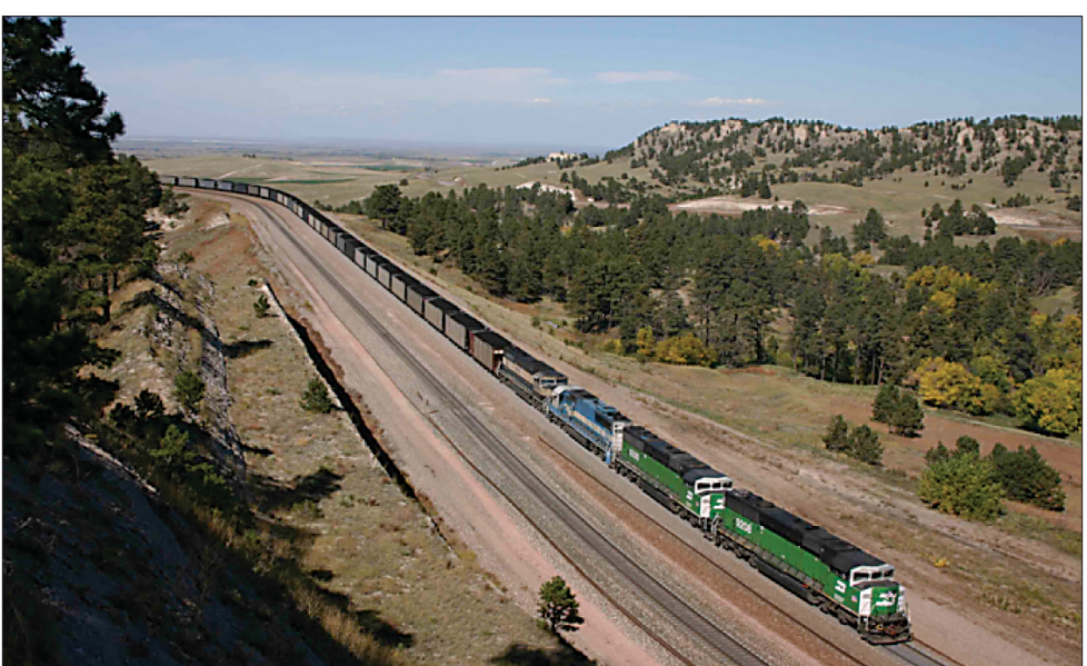
Figure 3. What is the mass of the CO<sub>2</sub> produced when the coal in one railroad car is burned?

Both our energy use and CO emissions can be reduced by using and producing energy in different ways. Implementing these improvements is associated with changes in our technology and energy use. It has been shown that the public is, to a large extent, unaware of the essential role played by energy in society, of the challenges that we face with our energy supply, and the steps we can take to increase energy efficiency. A recent study has shown that the public largely believes in a number of myths regarding our energy use (Sovacool and