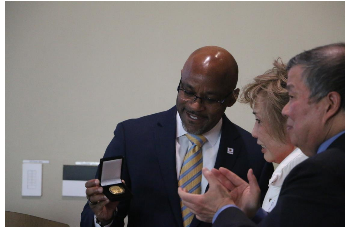
Hancock presents descendants of 1880 anti-Chinese riot victims with honorary gold coins, comparable to a key to the city, April 16, 2022.