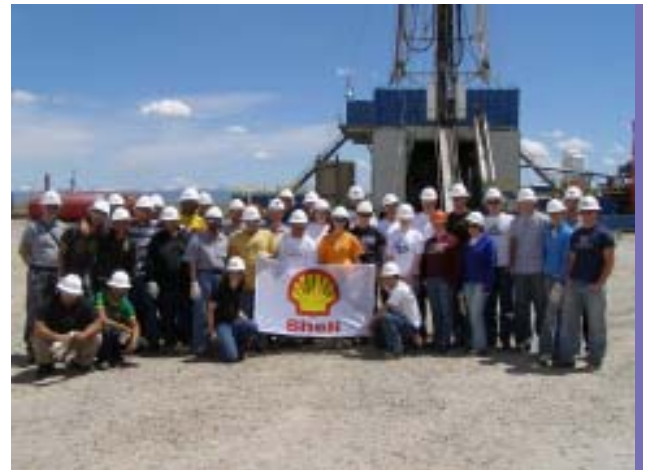
Alpha Team disassembling from Shell.