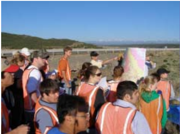
A short geology lesson while visiting Pioneer.