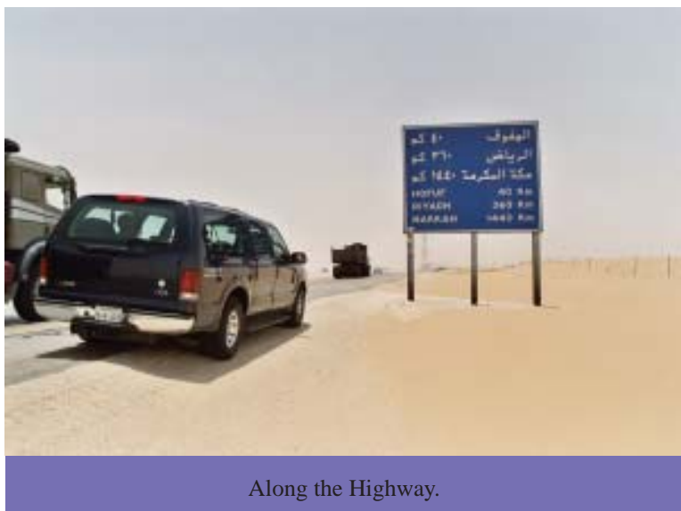
Along the Highway.

$10 million grant with a goal of approximately $35 to $45 million. All of you readers of this “News” are invited to participate in helping create a new “Showcase” venue for PE. Please be prepared to offer advice, ideas, and any other kinds of $upport you can imagine.