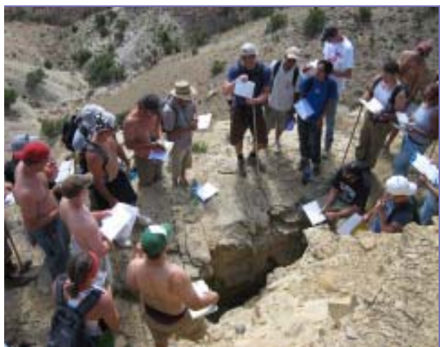
Don't Look Down.