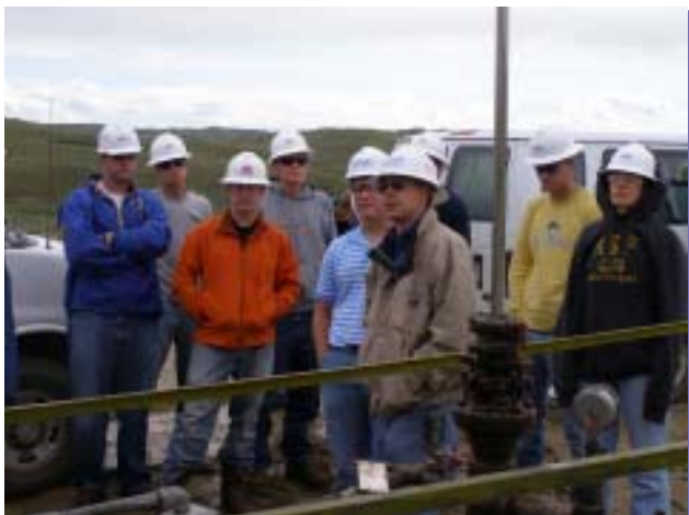
Listening to Pioneer talk about green oil.