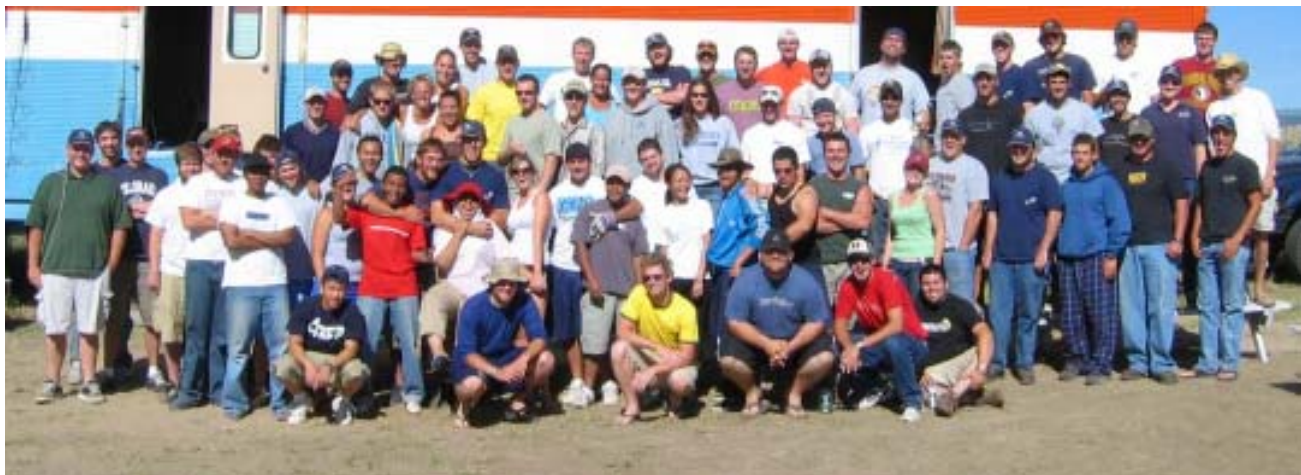
Massadona, Class of 2006