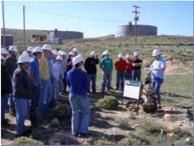
Alpha Team assembling while listening to Elk Pet.