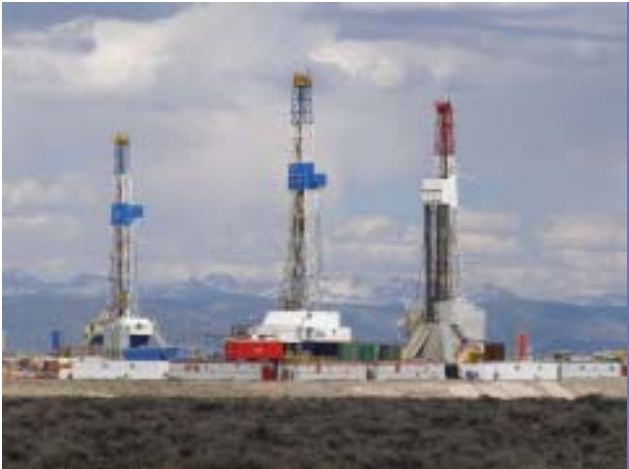
Three monster rigs at work for Questar.