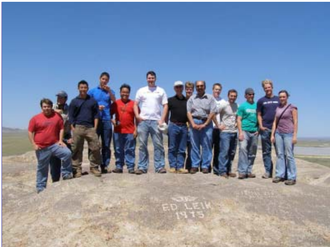
The gang standing on Independence Rock.