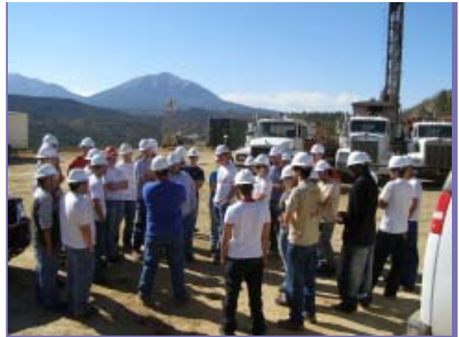
Frac job lesson while visiting Pioneer.