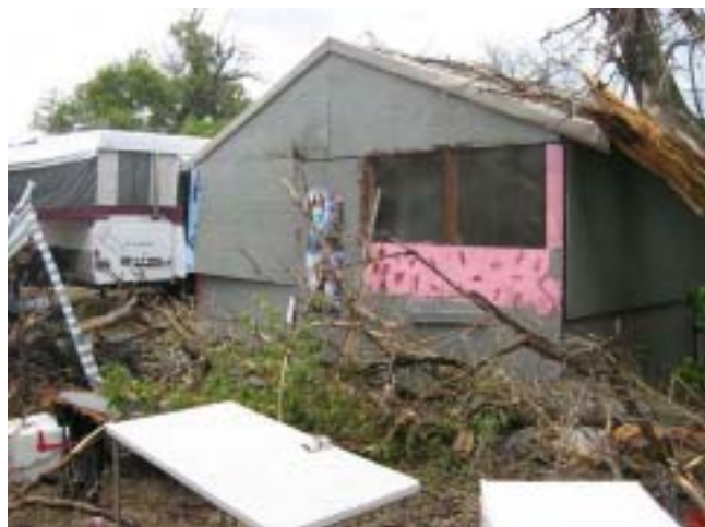
Hurricane Hits Massadona.