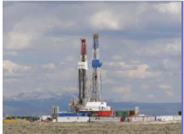
Double time team! Questar working hard.