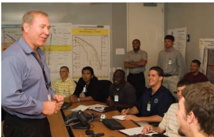
Chevron introduces students to their company culture.