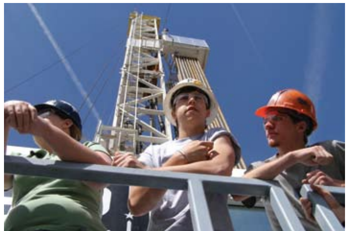
Future drilling managers relax on a Williams rig.