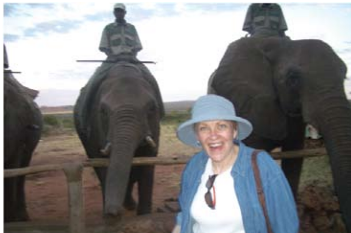
Elephant Safari in Zimbabwe