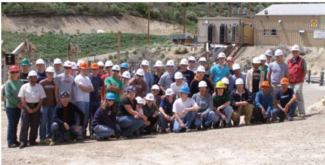
Students visit the Shell facility in the Piceance Basin.