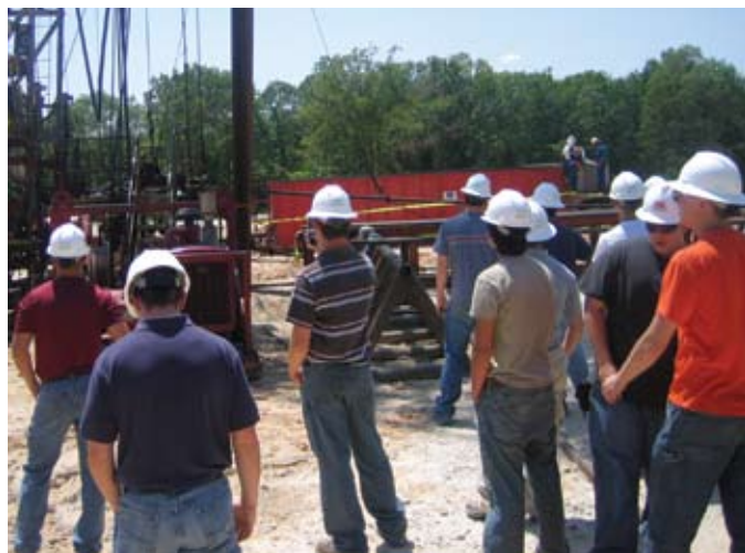
Students visiting a workover rig in Texas.