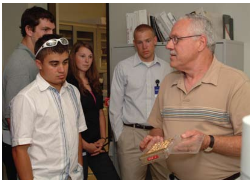
Students visiting the Baker Hughes field office.