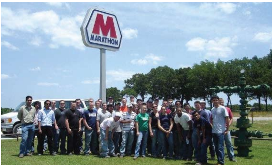
A group picture after students visit the Marathon field office.