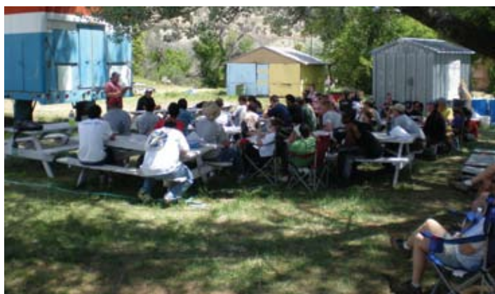
Debating the benefits and detriments of carbon dioxide flooding.

One final note that we thought might interest those of you who survived on ramen noodles and pop tarts at camp—would you believe that one night of our residence, the Massadona Tavern served over 100 steaks!! Nothing like a few students to ramp up your business!!