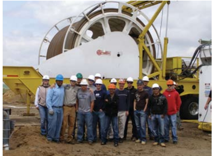
Students pose next to a coiled tubing rig.

One of the things I like to do in these newsletters is to be certain to list everybody that helped make these field sessions the successes that they are. However, in the hustle and bustle of the session, I sometimes don't get everyone's name that helped us. I apologize if I have misidentified or even left you out of our thanks. If I have inadvertently left you off, please let me know.