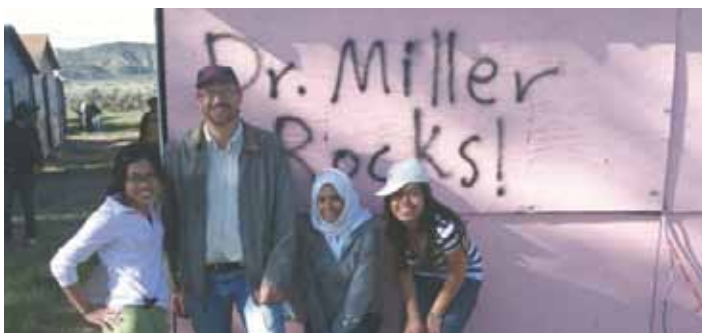
Enjoying the last day of summer field session.

Most of the 2009-2010 academic year was concentrated on three c's: classes, computers, and change. Classes were full. One fall semester class had over 130 students in it. It was difficult to tell if students were going or coming. Fortunately, there were four teaching assistants to help out. Splitting the