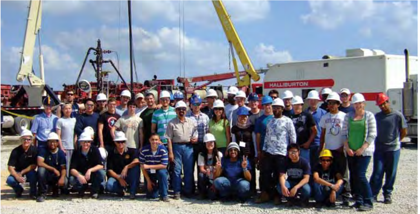
Picture taken at a hydraulic fracturing site during the visit to Devon Energy.

On Friday morning, we took the trip home. Thanks for the excellent work of faculty members and the teaching assistants on the team – no accidents, no surprises. Thanks again to our alumni and the companies – for your continuous support on our field sessions!