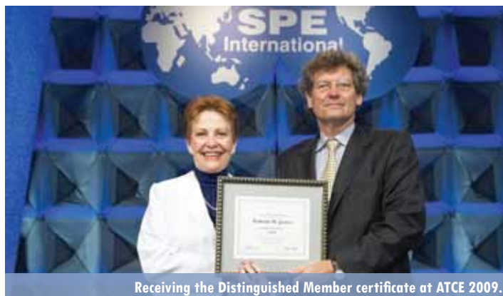
Receiving the Distinguished Member certificate at ATCE 2009.

*Sophomore/Freshmen - do not declare until Spring Semester