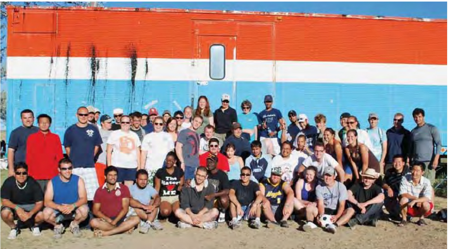
Session B group photo