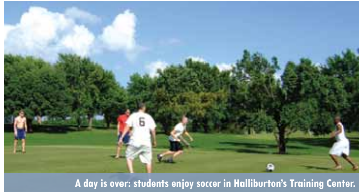
A day is over: students enjoy soccer in Halliburton's Training Center.