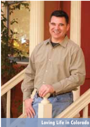
Loving Life in Colorado

Greetings alumni, supporters, and friends. The job of Assistant Professor at Colorado School of Mines must be very fun, because time here flies very fast. I would not believe that another year has passed except for the fresh new crop of faces listening with sleepy eyes to my first lectures of the semester. That, and the recognition that my older girl is starting Fifth Grade and "baby" is starting First.