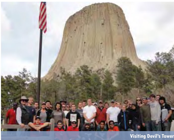
Visiting Devil's Tower

The next day, all we had to do is drive to North Dakota so I took the group on a tour of the Black Hills and Mt. Rushmore. We all met back at Spearfish and headed north en-mass. We stopped at one gas station in South Dakota way out of the way. I thought about it. Between our fuel purchase for five 15-passenger vans and 44 people buying drinks and junk food, that small town had an infusion for about $500.