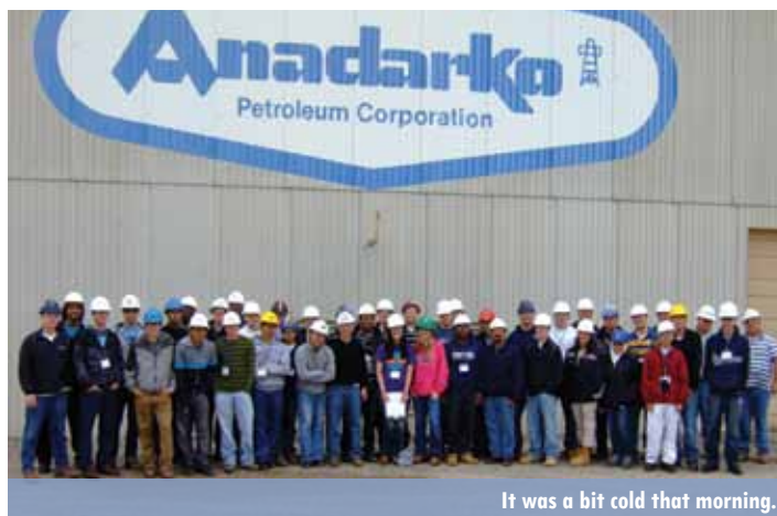
It was a bit cold that morning.