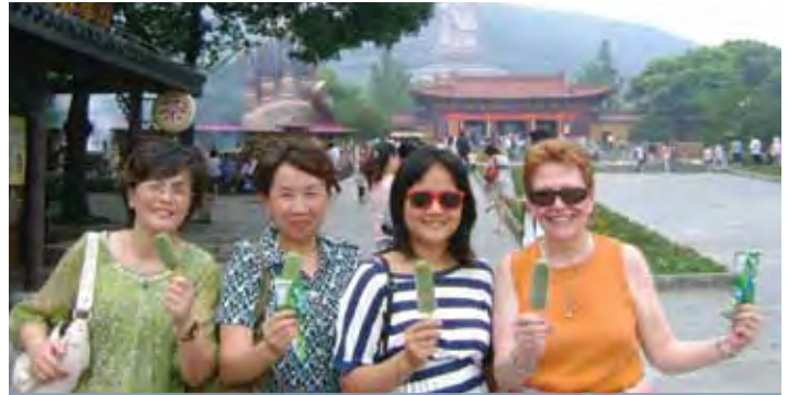
Green bean popsicles in China!

I continue to teach PEGN 308 Rock Properties to the sophomores and PEGN 413 the senior design lab. Teaching is my joy and my sanity! I advise two thesis based MS students and 1 PhD student. Being in the classroom is for