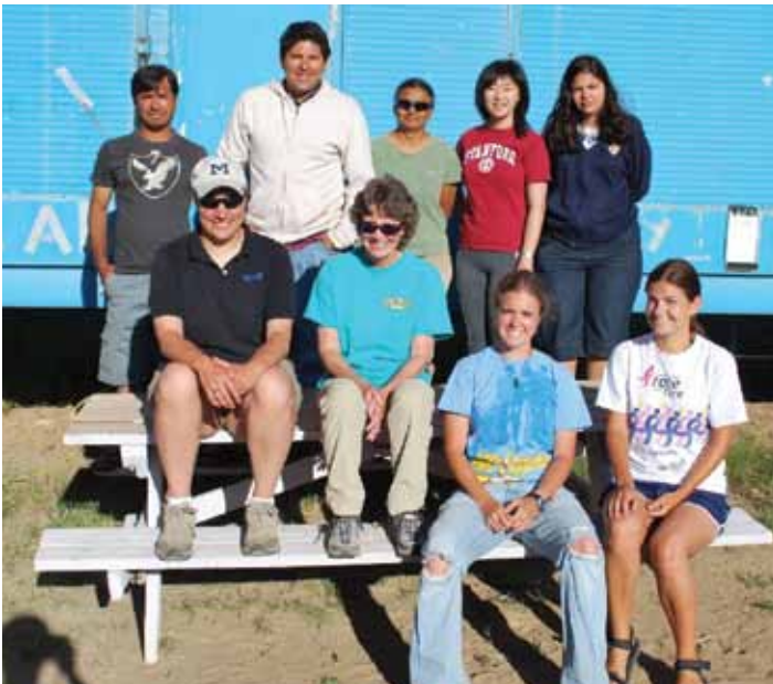
Some of the instructional crew.