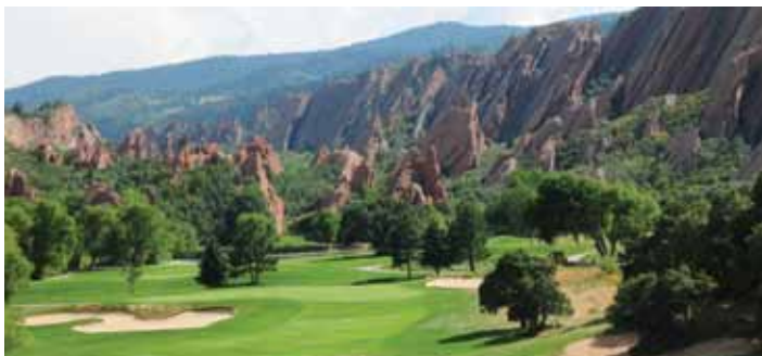
Second Annual SPE golf tournament held at breathtaking Arrowhead Golf Club

We are very excited about the formation of our new Energy Education Committee, which serves to educate the local community about the energy industry as a whole as well as the profession of petroleum engineering. We look forward to a couple of visits we have planned for this fall to local middle schools and high schools. We would like to extend a very special thanks to BP for their generous donation to help us bring this mission to life.