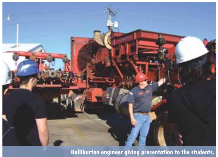
Halliburton engineer giving presentation to the students.