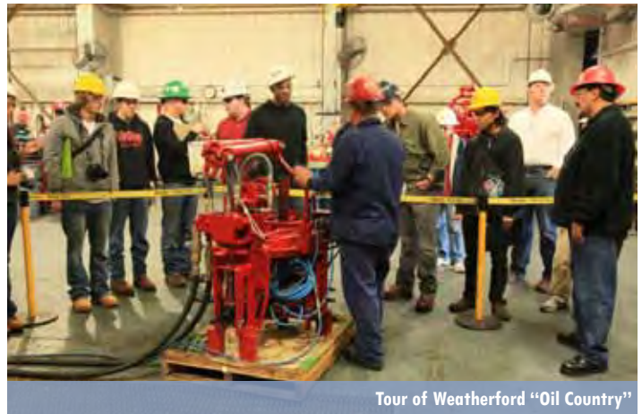
Tour of Weatherford "Oil Country"