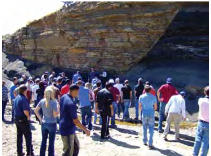
Looking at a coal outcrop in the Raton Basin near Trinidad, Colorado.