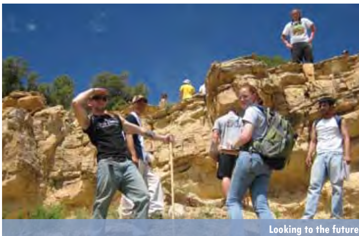
Looking to the future