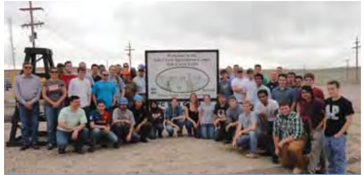
Group at Anadarko's Salt Creek Operations Center