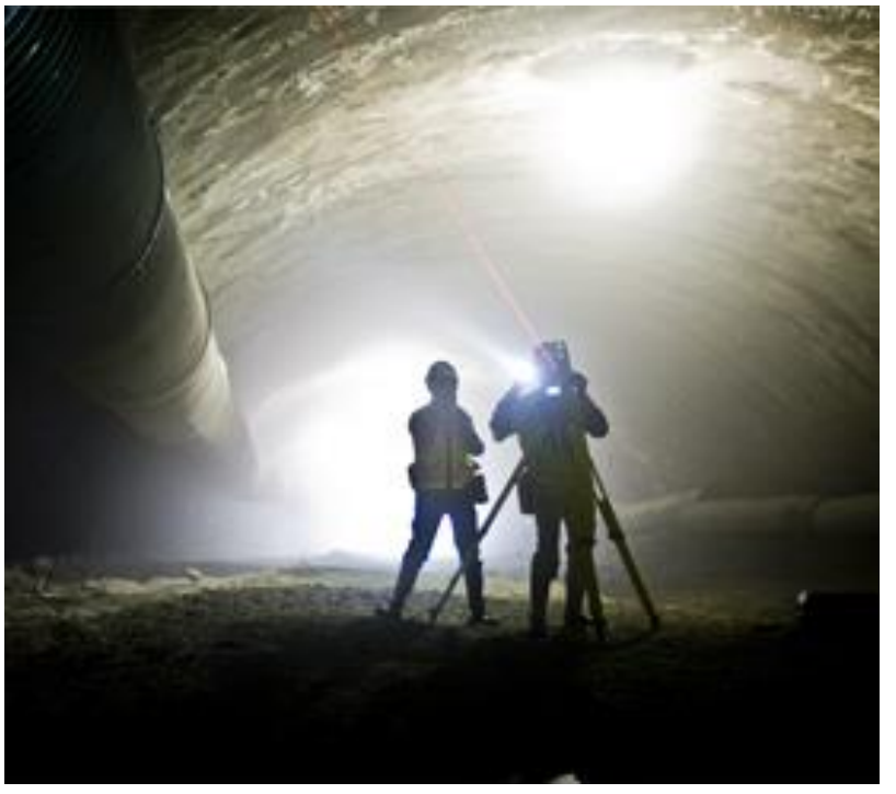
SR 99 Alaskan Way Tunnel, Seattle